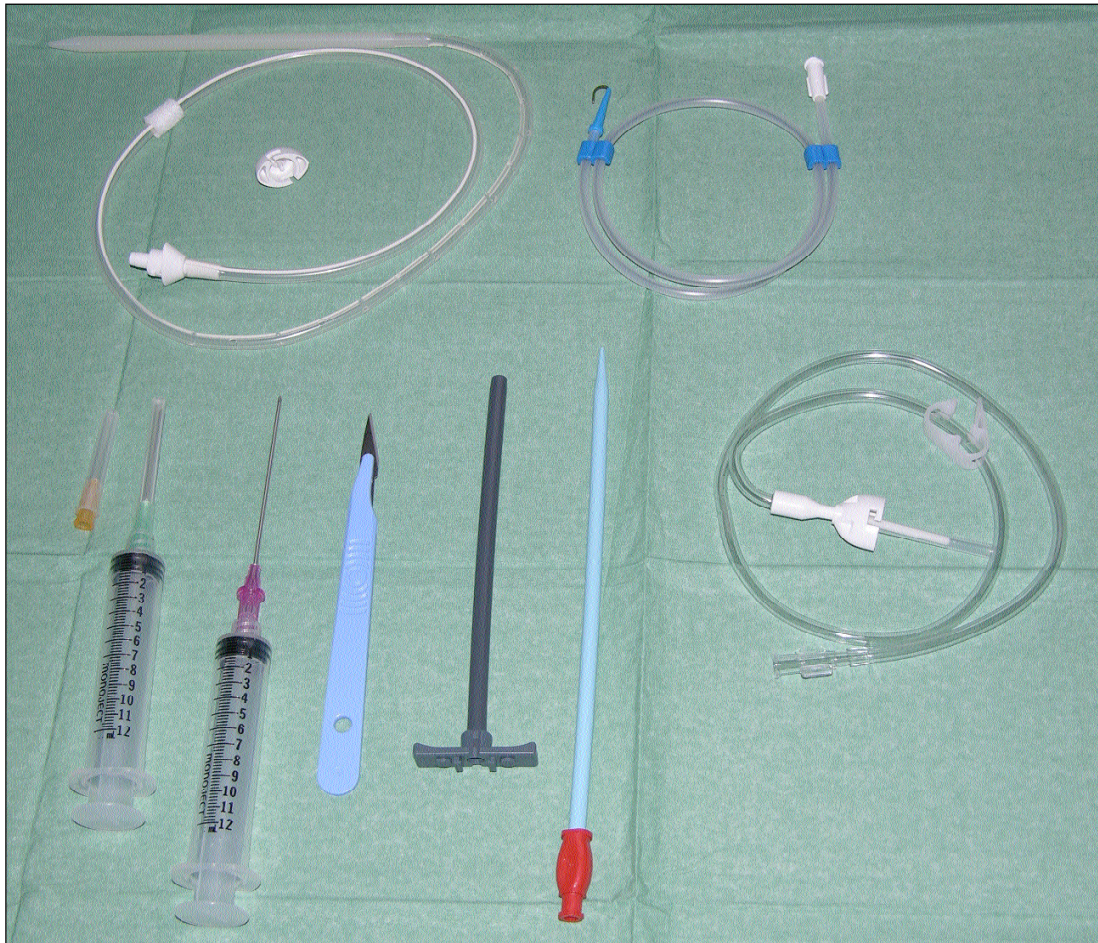
Figure 1. Equipment required for ambulatory indwelling pleural catheter insertion.